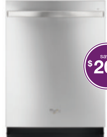
WHIRLPOOL® DISHWASHER (WDT780SAEM)

The PowerBlast® cycle removes stuck-on food with high-pressure spray jets, increased temperature and hot steam