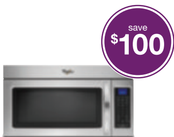
WHIRLPOOL® OVER-THE-RANGE MICROWAVE 1.9 CU. FT. (WMH32519CS) Also available in Black & White

CleanRelease® non-stick interior surface requires no harsh chemicals to wipe away spills