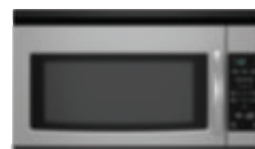
AMANA® OVER-THE-RANGE MICROWAVE 1.9 CU. FT. (AMV1150VAS) Also available in Black & White

2-speed fan provides the right amount of ventilation for every meal you prepare