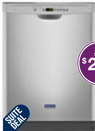
MAYTAG® DISHWASHER (MDB4949SDM)

The Heat Dry option engages a recessed heating element during the dry cycle to ensure dry dishes