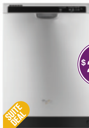
WHIRLPOOL® DISHWASHER (WDF520PADM)

The WashRight™ system with Silverware spray helps remove stuck-on food by delivering a concentrated shower of water to the in-door silverware basket