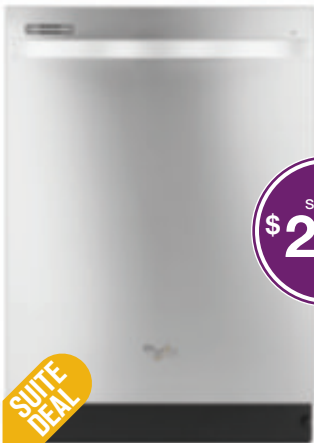
WHIRLPOOL® DISHWASHER (WDT720PADM)

The QuickShift™ system with the in-door silverware basket frees up rack space by easily fitting on the front of the lower rack or in the door