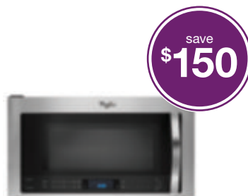
WHIRLPOOL® OVER-THE-RANGE MICROWAVE 1.9 CU. FT. (WMH76719CS)

The stainless steel cavity is designed to resist stains and splatters, and is engineered to outlast everyday dings