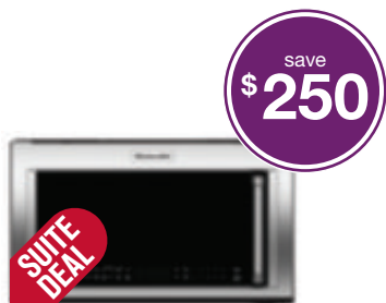
KITCHENAID® OVER-THE-RANGE MICROWAVE 1.9 CU. FT. (KMHC319ESS)