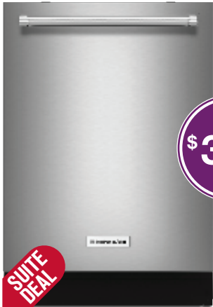
KITCHENAID® DISHWASHER (KDTE104ESS)