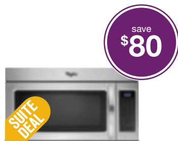
WHIRLPOOL® OVER-THE-RANGE MICROWAVE 1.7 CU. FT. (WMH31017AS)

Steam cooking conveniently steams foods such as rice, vegetables, and fish with the universal microwave steamer