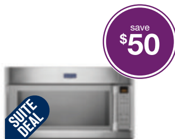
MAYTAG® OVER-THE-RANGE MICROWAVE 2.0 CU. FT. (MMV4205DS)

Sensor Steam and the Simmer function monitor the cooking processes for steaming or simmering