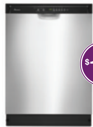
AMANA® DISHWASHER (ADB1700ADS)

The ReadySet™ system featuring the 1-Hour Wash cycle cleans dishes in half the time*