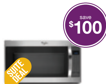
WHIRLPOOL® OVER-THE-RANGE MICROWAVE 2.0 CU. FT. (WMH53520CS)

NOTE: Steamer is available for order for other applicable models as an accessory (part #8205262RB)